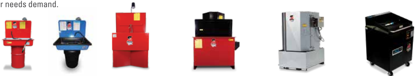
MODEL 30/16 Manual Sink

After more than 50 years, Safety-Kleen continues to lead the Parts Washing Industry by providing unrivaled service and top-notch equipment. With our extensive line of manual and automated equipment, our high performance solvent and aqueous chemistries and unmatched service, we can provide the customized equipment and program your needs demand.