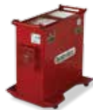
MODEL 275 Solvent Recycling for Existing Equipment