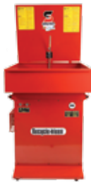
MODEL 270/270CR Solvent Recycling