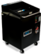
AQ-1 The ultimate in flexibility.