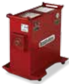
MODEL 275 Solvent Recycling for existing equipment