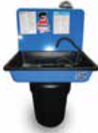
Aqueous MODEL 90/94 Manual Sink